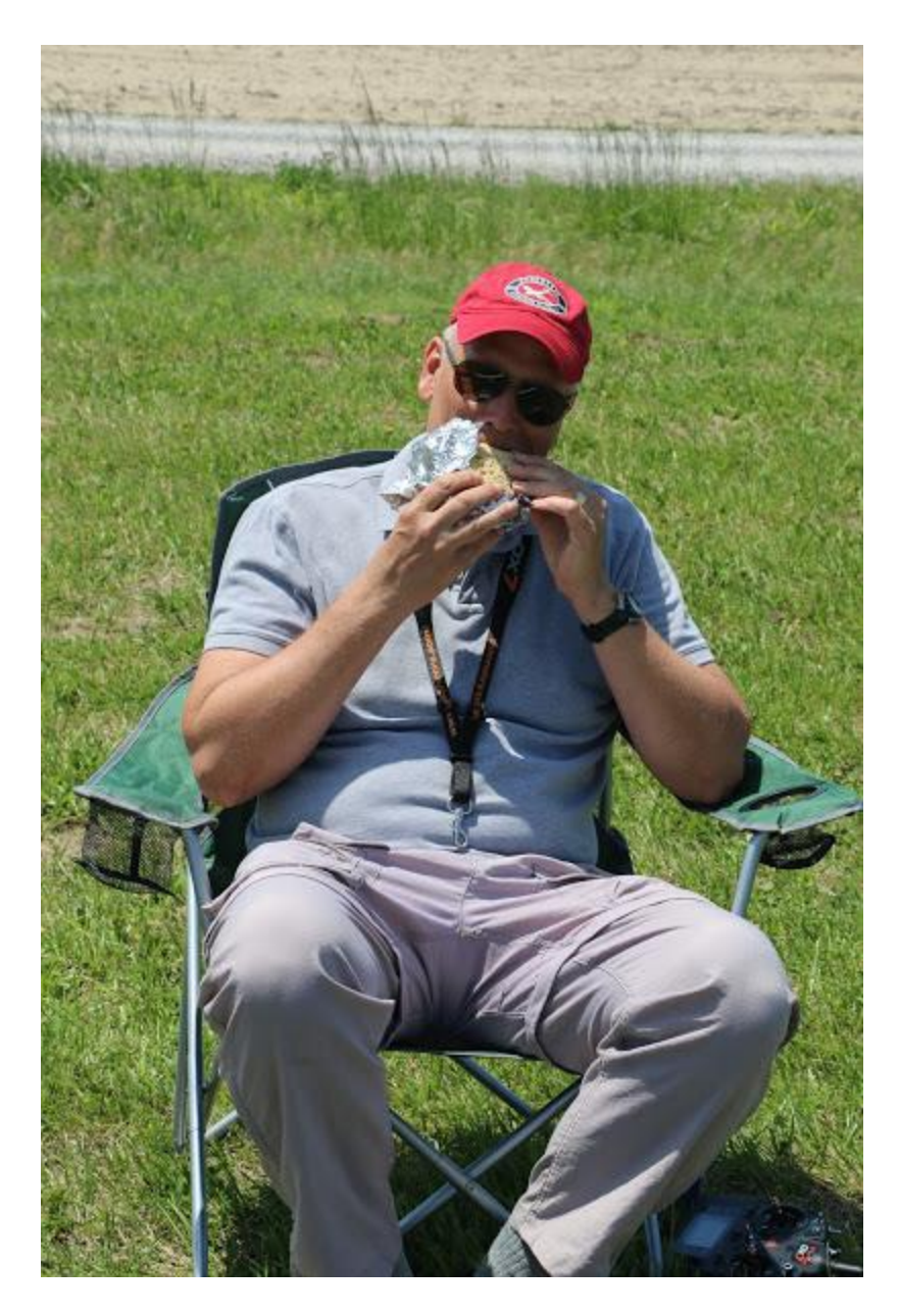
I know there is a good caption here somewhere – just can't quite find it.