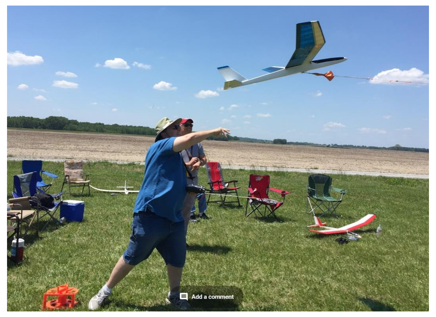
I spy another Aspire.....hmmm ⊕.....GAME ON!!

Articles, pictures and tech notes for publishing in the Carrier Wave are always appreciated.