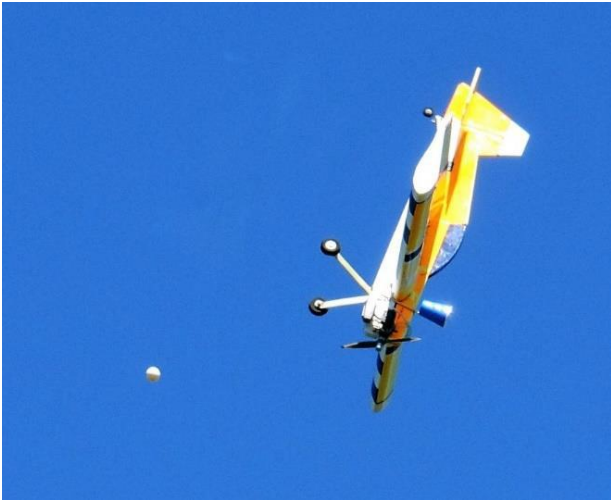
Jim West's Profile Edge just before - - -

After several hours of general fun flying with pleasant temperatures, sunny skies, and little wind, it was time for the fun to end and the entertainment to commence with fun-fly events. The first event and always a crowd pleaser, involved aerial bombing of a target. In the past we used golf balls but these had several drawbacks. They don't explode – very disappointing. Also, a poor release of the dimpled ordinance has been known to do more damage to the bomber than the intended target. Enter a biochemical weapon substitute – the raw egg. Much, more fun and everyone enjoys a good car wreck or egg splatter. We had five pilots sign up for the event and unfortunately only four completed it. The bomb drop usually has at least one casualty and this time Jim West of the Phantom club was the victim. Jim had a little target (or bomb release) fixation and was well nose down before finally laying his egg. Unfortunately, Jim had a flame out and barely pulled out (a bit) before “landing” in the weeds. Very little damage overall save for a couple of covering punctures and a bent aileron linkage.