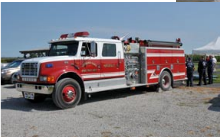
The Orchard Farm Fire department was out for a “Sunday drive” and stopped by to see what was happening. Mitch Galatioto gave them a complete explanation of the contest and modelling in general.