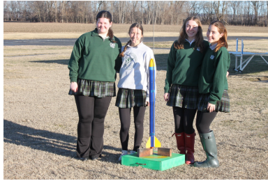
From Left to right our Rocketeers are: